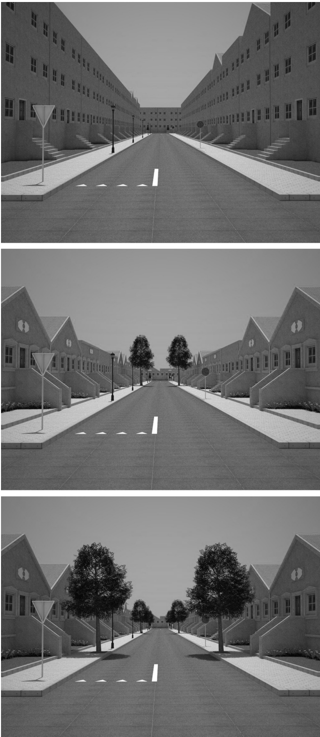
Fig. 1. Streetscape images with the highest, lowest and closest to average likelihood of restoration ratings, calculated looking across the participants who provided the ratings. (From left to right) The streetscape image with lowest mean rating for restoration likelihood ( M=2.43 , SD=2.19 ), the streetscape image with the closest-to-average mean rating for restoration likelihood ( M=4.24 , SD=1.74 ) and the streetscape image with highest mean rating for restoration likelihood ( M=6.74 , SD=2.51 ).