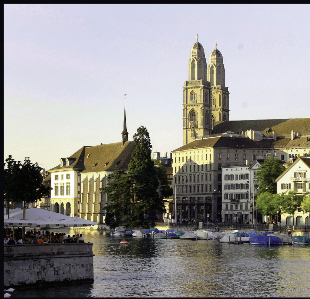
The Greater Zurich Region ranks first for economic potential of all the small regions in Europe