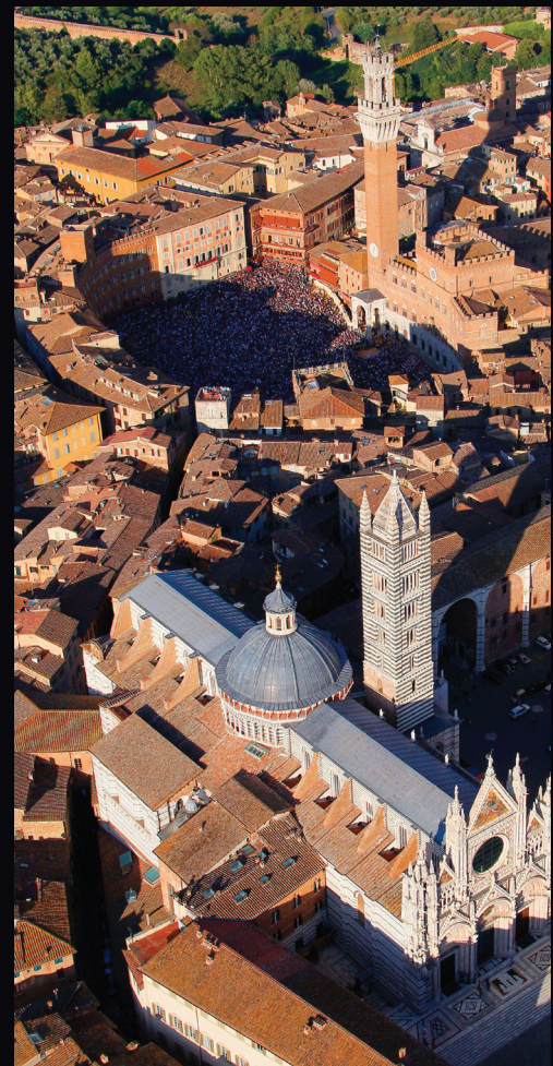
Tuscany ranks top southern European region for FDI Strategy