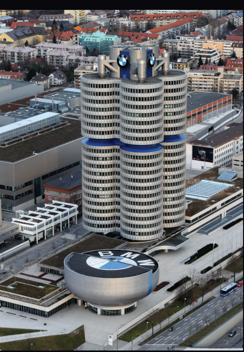
Driving growth: Munich is second in the western European city ranking