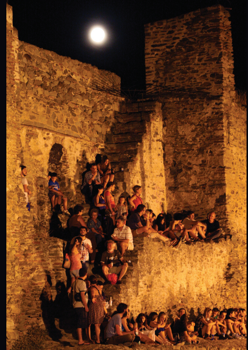
Thessaloniki: leading the way for human capital and lifestyle