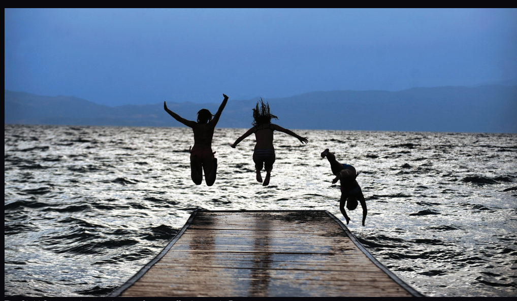
The Ohrid-Struga region: number one for cost effectiveness in Europe